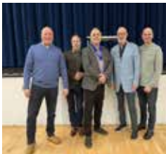
SPC Cllrs at Big Thank You (above); Churchyard check (right); and phonebox asset checking (next right).

SPC signposts to 'News' articles from its social media posts, recent Facebook posts can be also viewed on SPC's website. Plus we share lots of images! Here are just a few since our last SCAN page: